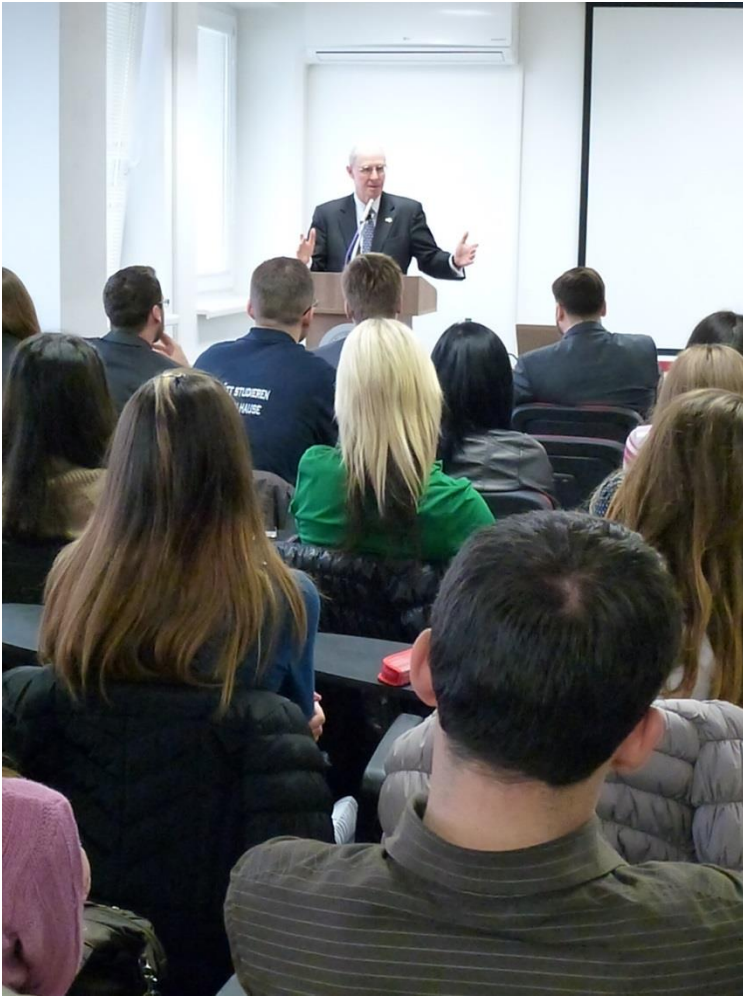
A lecture of the U.S. Ambassador Theodore Sedgwick