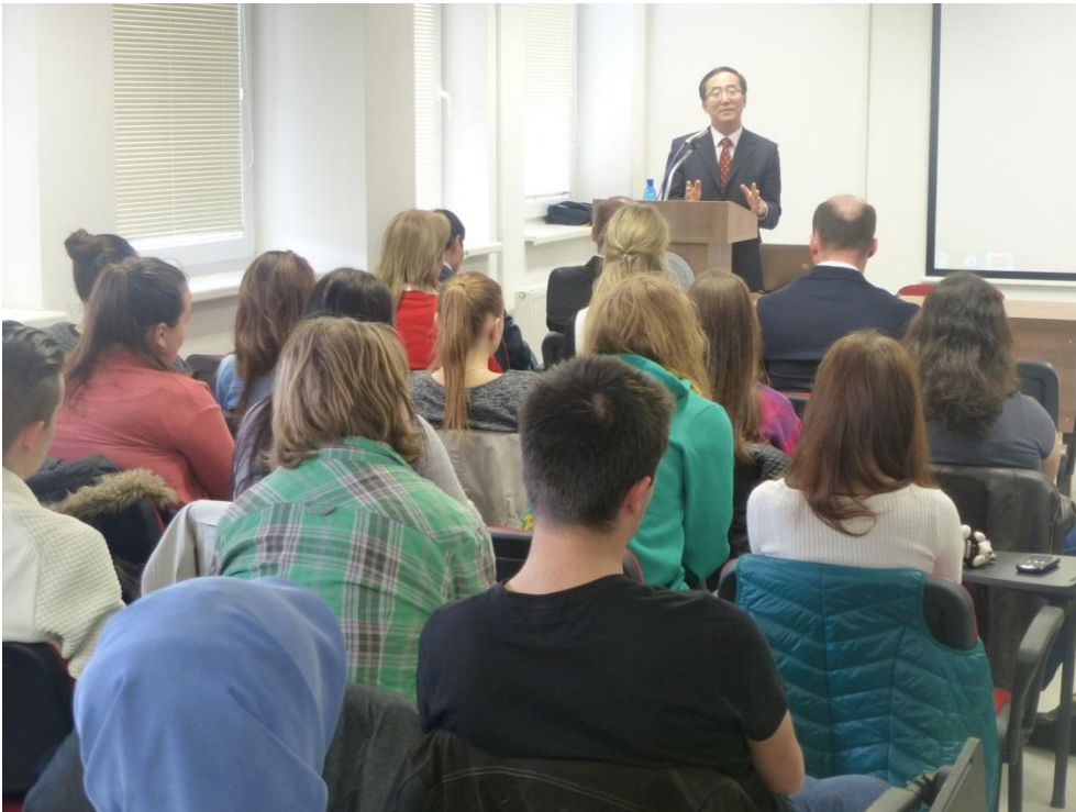
A lecture of the Ambassador of the People's Republic of China Pan Weifang