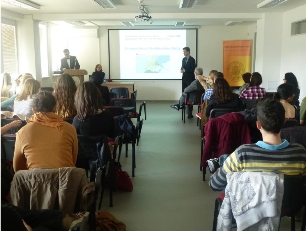
A lecture of the Ambassador of the Republic of Poland Tomasz Chłoń